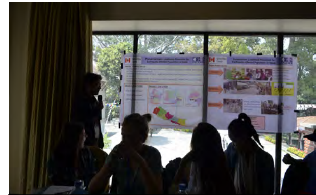
Presentation of Punarnirman Project