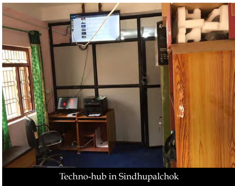
Techno-hub in Sindhupalchowk

Until now, altogether 8 techno-hubs have been established at municipalities and rural municipalities. Among them, 6 are municipal techno-hubs and 2 are community techno-hubs. The techno-hubs established at municipalities are Sanfebagar in Achham, Barabise in Sindhupalchowk, Amargadhi in Dadeldhura and Jay Prithvi in Bajhang District. Similarly THs established in rural municipalities are Kailari rural municipality, Kailali and Bannigadhi-Jayagadha in Achham. Two community THs at Urma in Dhangadhi Sub-Metropolitan City, Kailali and Sankhu of Konjyosom rural municipality have also been established.