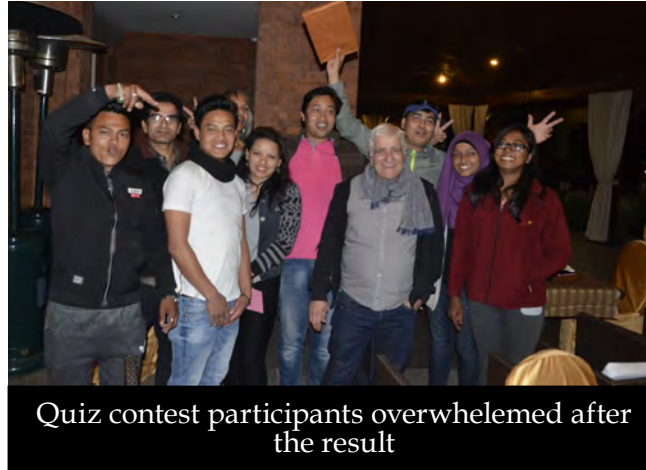
Quiz contest participants overwhelmed after the result

event allocated time for energizers, and fanfare activities. Simultaneously the beautiful location for the AGM gave the participants a chance to visit the surroundings: walk through the jungle, golf course, swimming pool, spa treatments, yoga sessions and chanting prayers. All this experience made us all feel refreshed and rejuvenated for a new working year