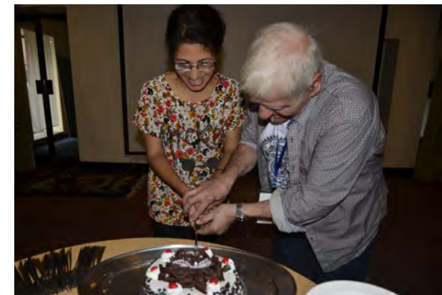
Celebrating International Women's Day