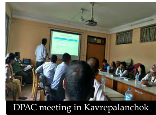
DPAC meeting in Kavrepalanchok