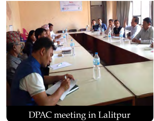
DPAC meeting in Lalitpur

CECI/Punarnirman project conducted District Project Advisory Committee (DPAC) meetings in Sindhupalchowk, Kavrepalanchowk and Lalitpur Districts from January to April 2018. It is a mandatory provision of the government to conduct the DPAC meeting. The meetings were accordingly hosted by the project district implementing partners: Tuki Association, Rural Development Multiple Service Committee (RDMSC) and The Society of Local Volunteer's Effort (SOLVE) Nepal and chaired by the District Coordination Officers of the respective districts. Officers from government authorities, private sectors and concerned stakeholders, including local media participated the meetings. The meetings kept the participants informed