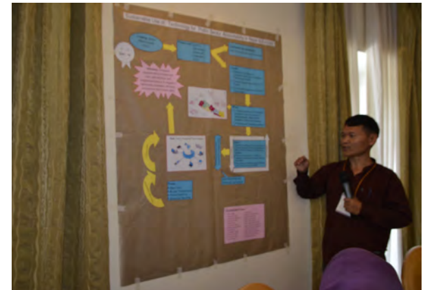
Presentation of Susasan Project