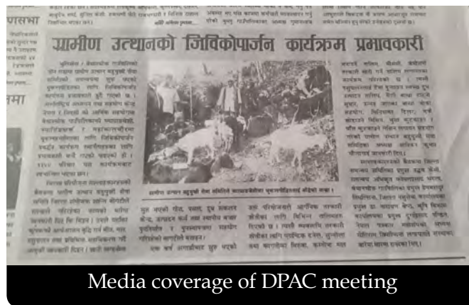
Media coverage of DPAC meeting

about the project activity results achieved during one year period and further plan of actions. Subsequently the meetings opened up the forum to receive recommendations and suggestions from the participants for the effective implementation of the project activities, where some of the participants provided fruitful suggestions. The DPAC participants appreciated the work done by the project.