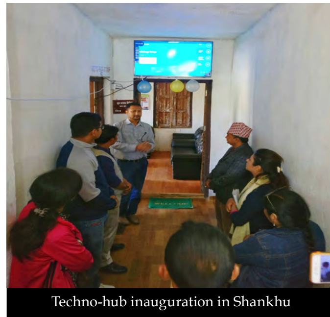
Techno-hub inauguration in Shankhu

Digital technologies have spread rapidly in recent years around the world which have played an important role in keeping people better informed. It has been contributing