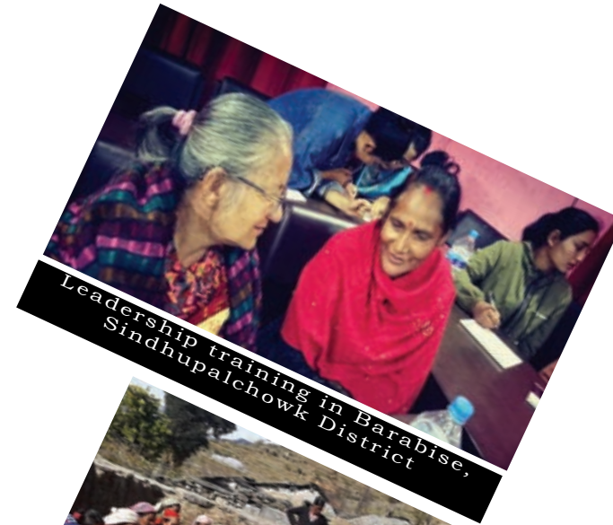
Leadership training in Barabise, Sindhupalchowk District