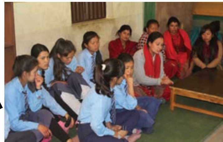
Community Score Card (CSC) training in school