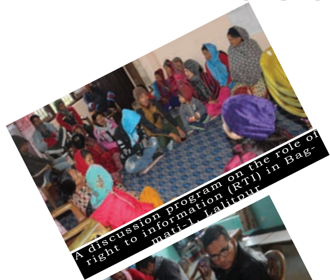
A discussion program on the role of right to information (RTI) in Bagmati-1, Lalitpur

CECI's Susasan Project is running in its' third year of project implementation. The project has been engaging women and the marginalized communities in various training programs (Gender Equality and Social Inclusion, leadership development, local lever planning process, policy, use of integrated technology, including mobile applications, governance and accountability mechanism, etc.), workshops and advocacy campaigns. As a result, they have been able to speak up about their need and entitled budgeted at the local level and get access to them improving their quality of life.