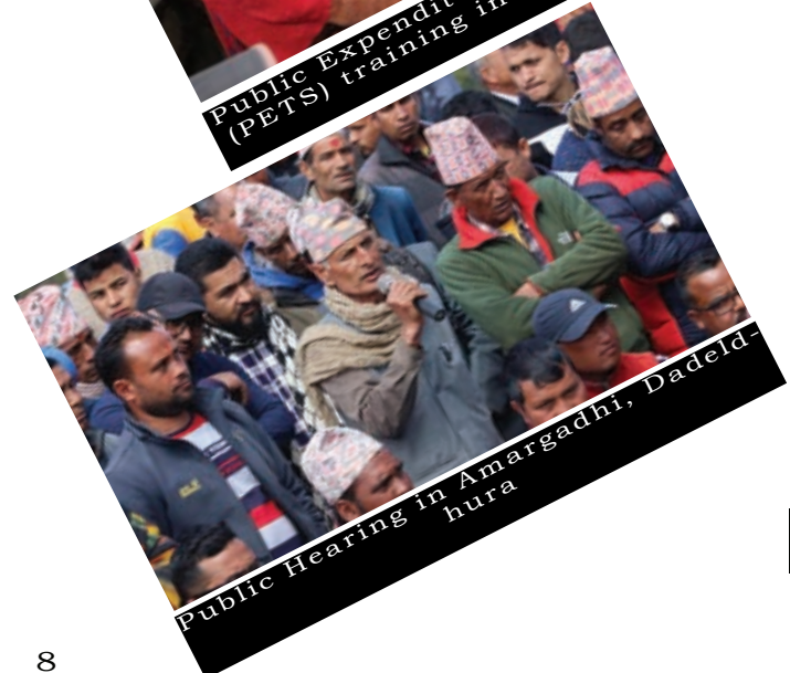
Public Hearing in Amargadhi, Datedl-hura