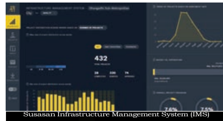
Susasan Infrastructure Management System (IMS)

The Susasan Project is being implemented in Sindhupalchowk, Lalitpur, Achham, Bajhang, Dadeldhura and Kailali Districts of Nepal with the funding from the Government of Canada provided through the Global Affairs Canada and technical assistance of CECI.