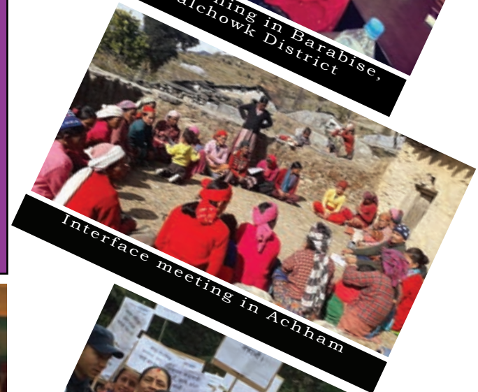
Interface meeting in Achham