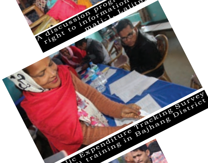
Public Expenditure Tracking Survey (PETS) training in Bajhang District