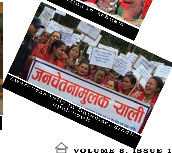
Awareness rally in Barabise, Sindhupalchowk