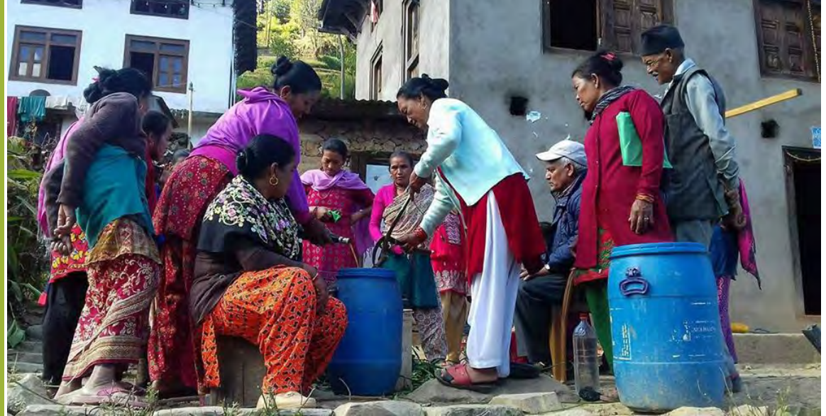
Training on making organic fertilizer

The agricultural inputs were provided in close coordination with the government line-agencies and private traders/companies. A total of 718 members (78% women) benefitted from the training and agricultural-inputs.