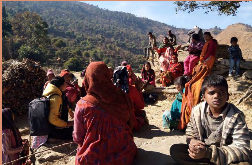
GESI ToT in Dadeldhura

CECI under Susasan Project provided Training of Trainers (ToT) on formulation of GESI policies to six partner District Civil Society Organizations (DCSOs) in Achham, Bajhang, Dadeldhura, Kailali, Sindhupalchowk and Lalitpur districts. During the training sessions, the DCSOs were facilitated to develop their action plans and formulate/update their institutional GESI policies. Further, DCSOs gave GESI Sensitization and Policy Formulation Trainings to local CSOs in their respective districts. During the training sessions locally elected representatives and GESI focal