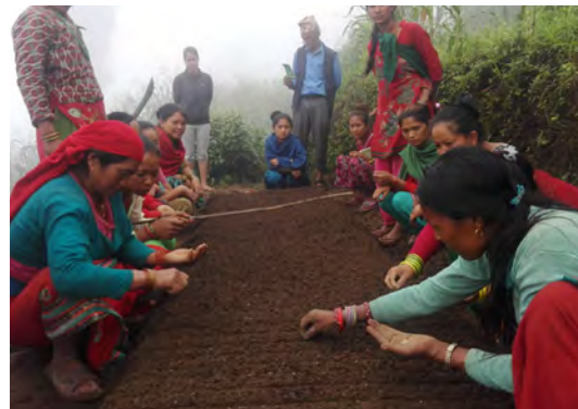
Training on seeding and planting