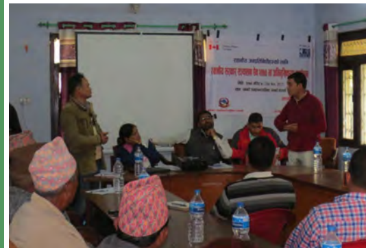
Orientation program in Bajhang