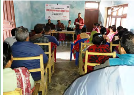
Orientation program in Kailali

T he orientation program discussed on the main features of the act and the roles and responsibilities of the elected representatives. Altogether 240 participants benefitted from the orientation program.