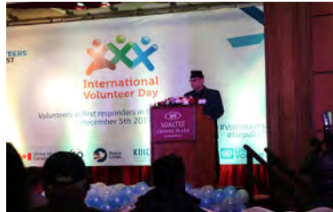
CECI Country Representative addressing at the ceremony