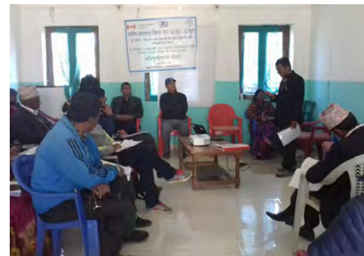
Orientation program in Dadeldhura