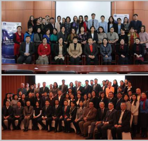
Top: Fibre Council, above: Green Construction Council

The Mongolian Wool and Cashmere Association led the latest fibre meeting, where education institutes urged companies to offer internships for students to become skilled human resources.